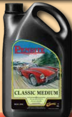
CLASSIC MEDIUM 25W-70