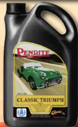
CLASSIC TRIUMPH 20W-60