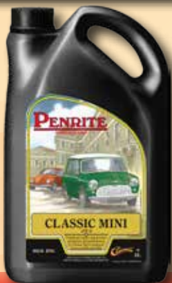
CLASSIC MINI 20W-50