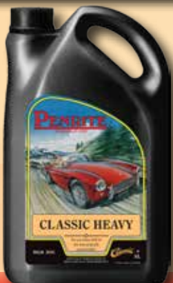
CLASSIC HEAVY 40-70